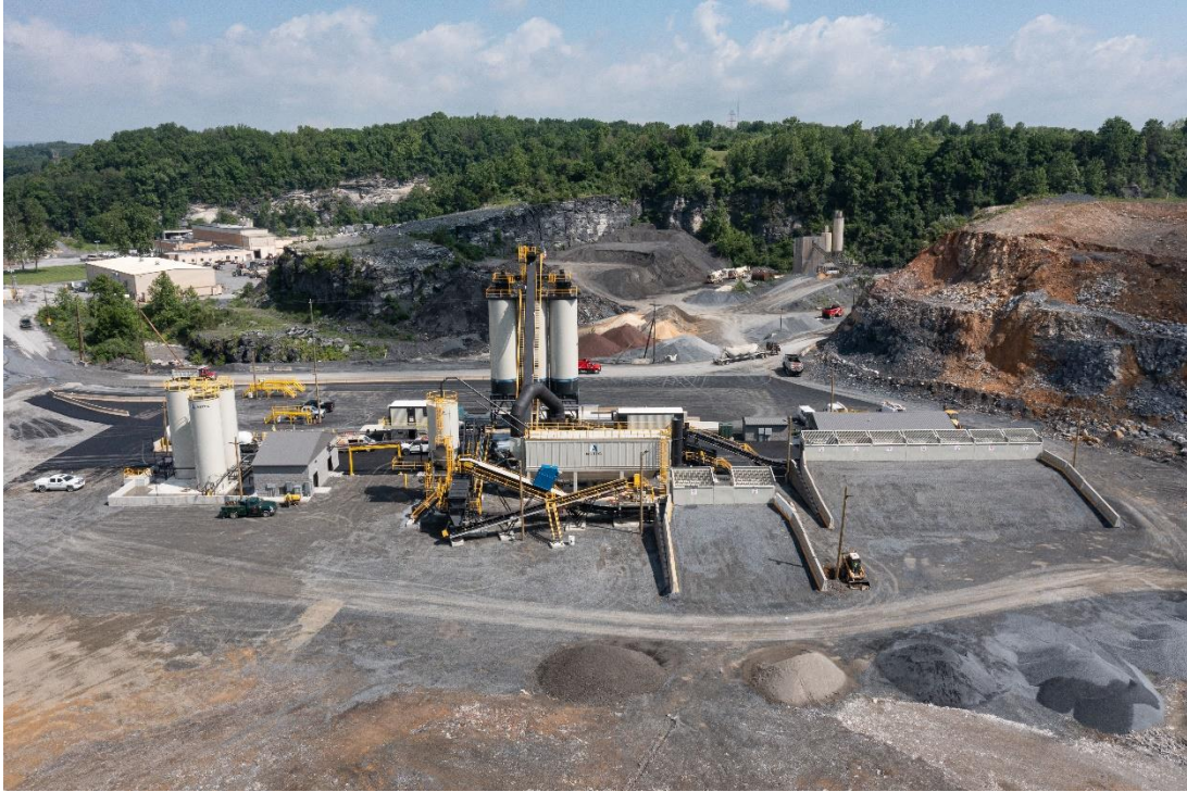
H&K's brand-new Easton Asphalt plant is prepped and ready for production in this late June 2022 aerial drone photograph!