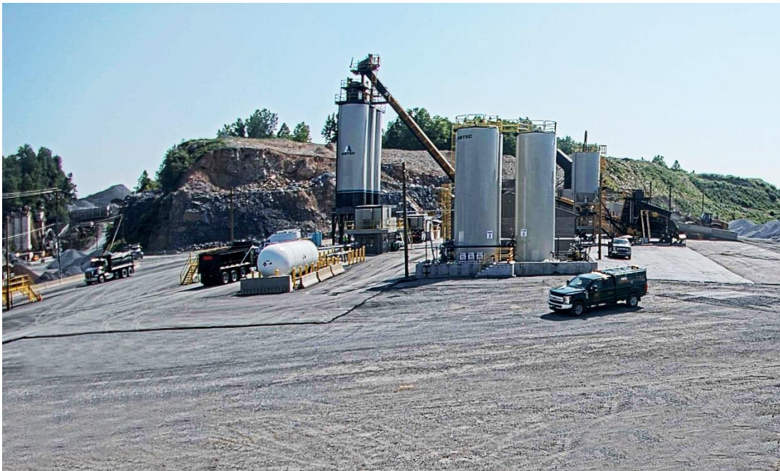
A "live" Earthcam photo of Easton Asphalt as captured on July 11, 2022, or date of this Press Release.