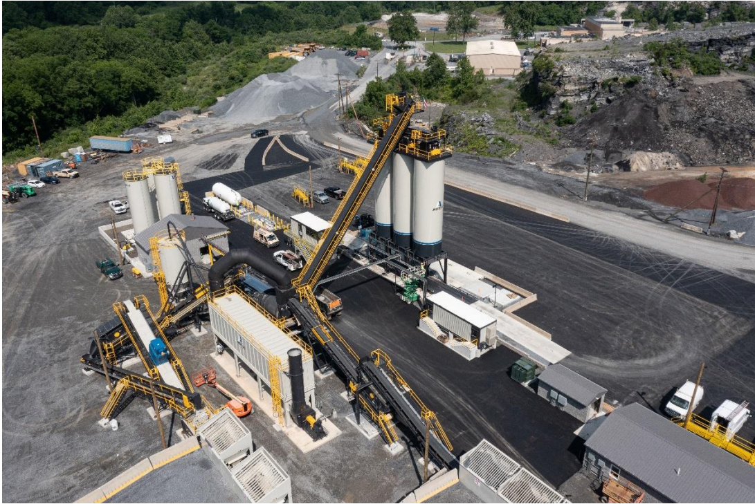
Easton Asphalt's fully redesigned plant entrance and exit pattern is emphasized in this photograph. Customers should expect smooth and efficient product pick-up at H&K's newest and most efficient asphalt plant.